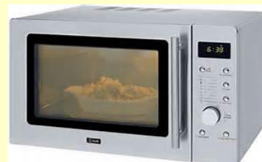
Microwave Ovens $10.00