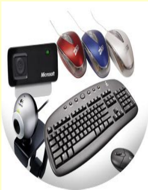
Computer Accessories Keyboards, Mice, Hard Drives Scanners, Speakers, etc $5.00