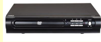
DVD Players, VCR's DVR's and Other Video Players $5.00