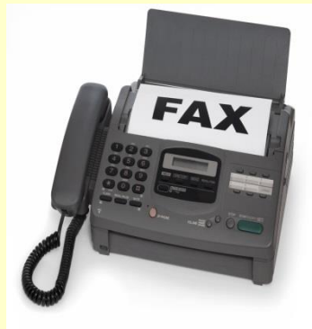
Fax Machines $5.00