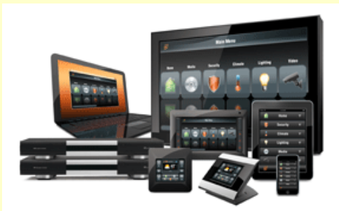
Video Display Devices of at least 7" Long in the Longest Diagonal Dimension. These include TV, Laptops and Computer Monitors.