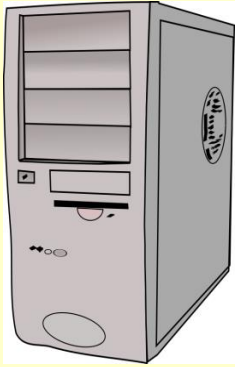
Desktop Computers $5.00