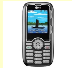
Cell Phones $1.00