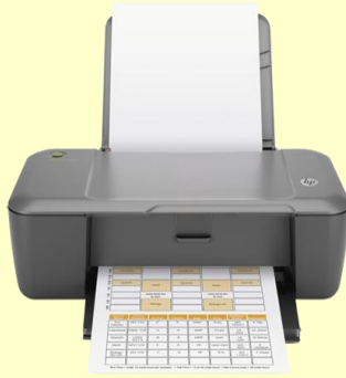
Desktop Printers $5.00